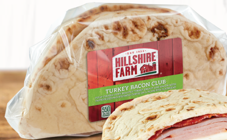
10000039825 Hillshire Farm® Turkey Bacon Club