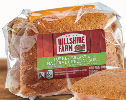
10000097595 Hillshire Farm® Turkey Breast & Natural Cheddar Sub