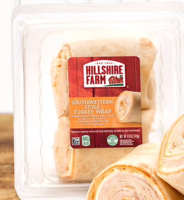
10000097586 Hillshire Farm® Southwestern Style Turkey Wrap